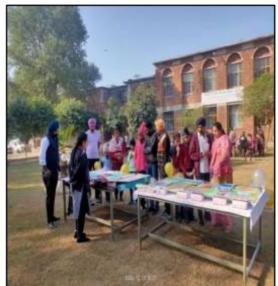
Figure 1 Exhibition of TLM

variety of TLMs to aid the teaching-learning process. Teachers are encouraged and rewarded to innovate different TLMs for different levels of students. Use of Jodo Gayan, mathematics park teaching aids for mathematics, and interactive TLM like IBB (interactive bulletin boards), self-correcting cards, and executing practicals in the labs under the guidance of expert teachers Satya Bharti Schools has established Robotics Labs with the collaboration of Stemrobo Tech Pvt. Ltd., Noida, UP, to excel in the sphere of technology and science, where students of different grades create various innovative things and equipment. An initiative