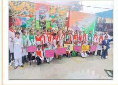
Skit by Students