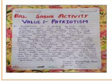
Bal Sabha Activity