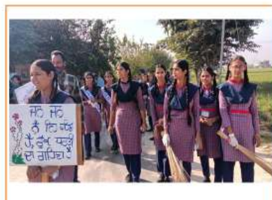
Swachhata Hi Sewa