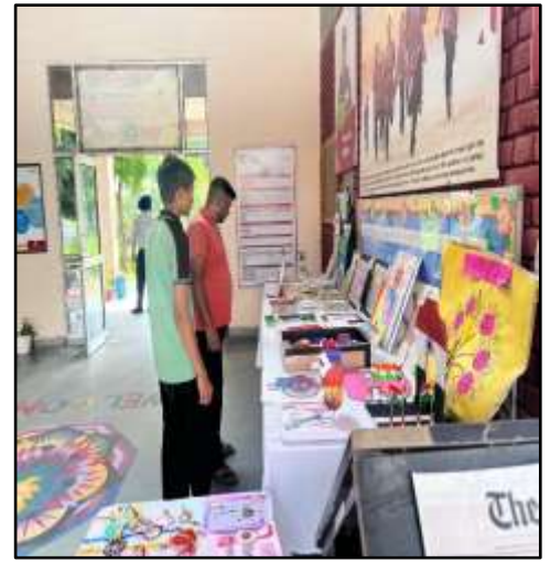
Figure 2 TLM Exhibition at Sr. Sec Jhaneri

by Bharti Airtel Foundation is the annual TLM Mela, TLMs used effectively in classrooms. The competition is conducted at three levels— School Level, District Level, and National Level. Data on TLM usage during the year :