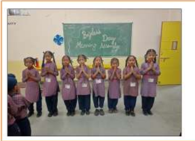
Bag less Day